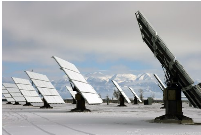
Figure 2. Solar Tracking PV Array

Figure 2 provides an example of a large scale photovoltaic system.