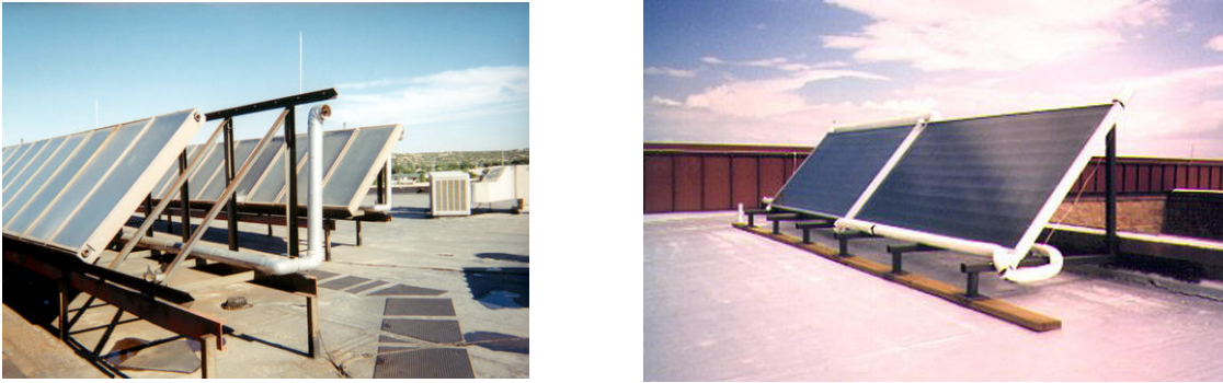
Figure 6. Medium and Small-Scale Solar Water Heating – Roof Mount

The photographs in Figure 6 show typical water heating system solar collectors.