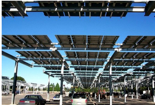
Figure 3. Solar parking lot canopy

Figure 3 shows an example of a solar parking lot canopy.