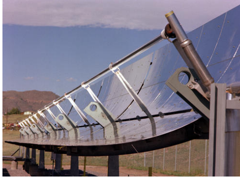
Figure 8. Parabolic Trough Collector

Process heating, used in industrial environments, generally requires the development of much higher temperatures for the production of steam or high heat. Figure 8 shows a parabolic trough system, where a highly reflective parabolic surface concentrates sunlight upon a central liquid-carrying tube. Systems like this are capable of producing process heat and steam in the temperature range of 200° - 400°F.