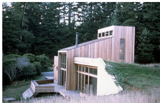
Figure 4. Passive Solar Architecture 36

Figure 4 provides an example of a passive solar residential structure.