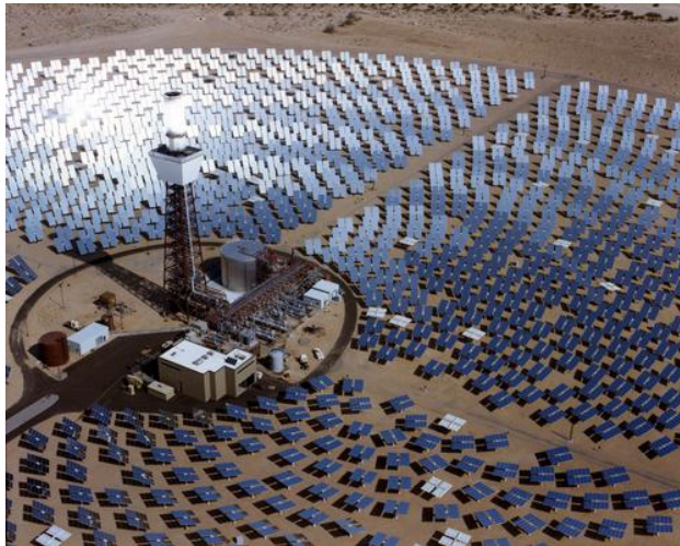
Figure 5. Active Large Scale Thermal System

Figure 5 illustrates a large scale thermal system.